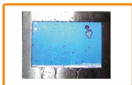
■ IP65 in Front & Side Frame