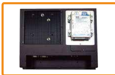
■ HDD Anti-Vibration Easy-install kit