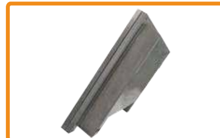
■ Ultra Slim Design